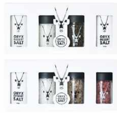
Retail -Gift packs