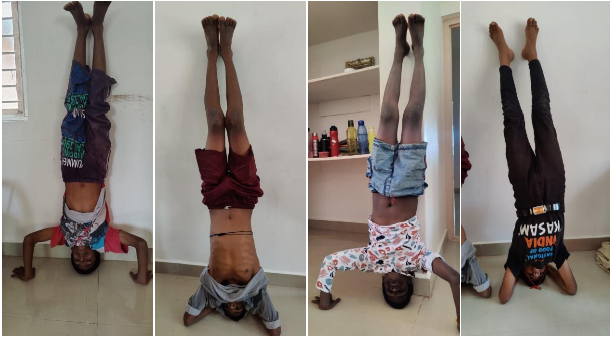
.. and sometimes it`s good to see the world upside down