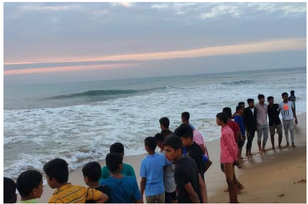
Excursions to Chennai Marina Beach and Pondicherry Beach