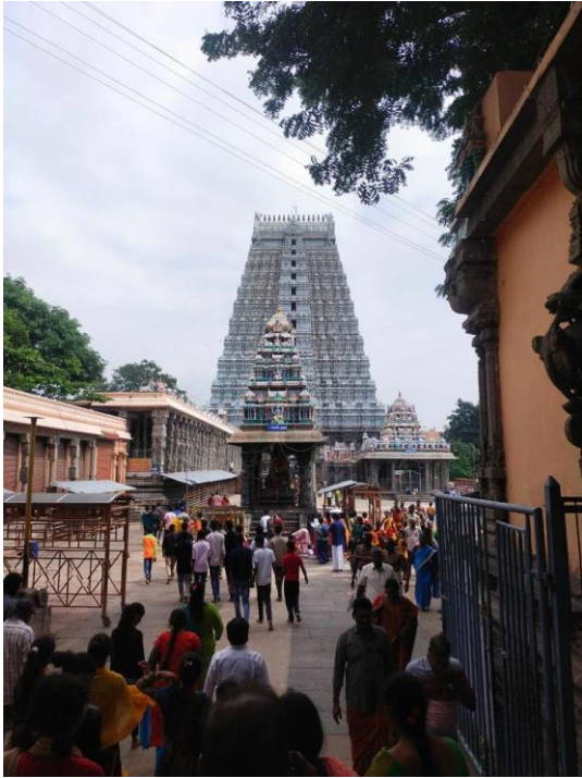
A visit in the Golden Temple in Vellore