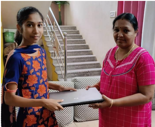
Handing over one of the donated laptops to a collage student. Great joy!