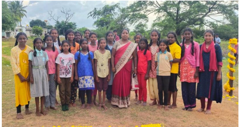
A class photo of the girls sportsgroup