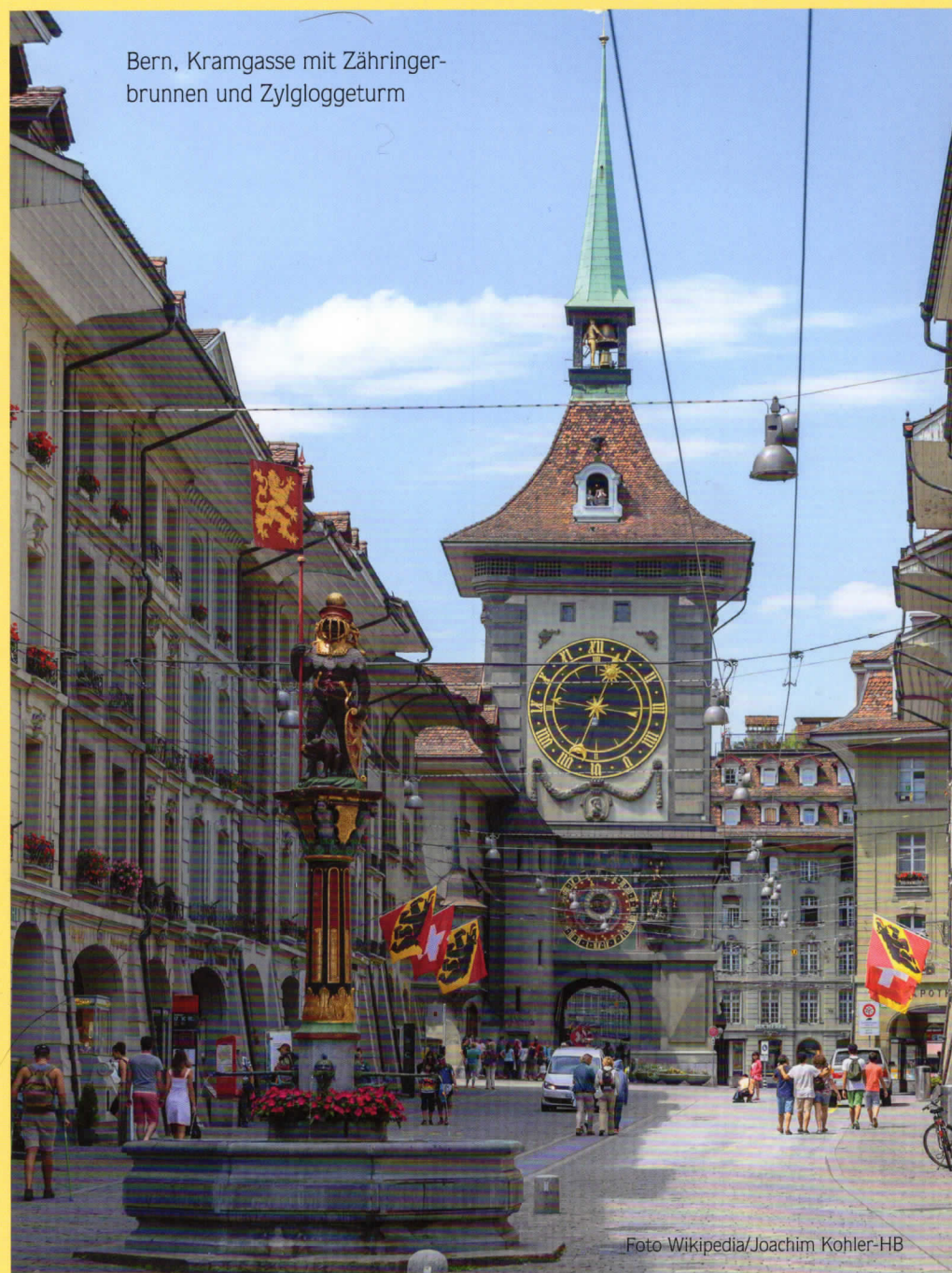
Bern, Kramgasse mit Zähringerbrunnen und Zytgloggeturm

The Philatelic Journal of the Association Internationale des Journalistes Philatélistes