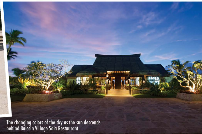
The changing colors of the sky as the sun descends behind Balesin Village Sala Restaurant

windows along winding streets; Bali, the Southeast Asian paradise known for its magical mix of art, nature, religion and romance; Phuket, Thailand's bustling beach resort with a more select clientele and minus the carmine places for the carnal crowd; and lastly, a Philippine village, home away from home.