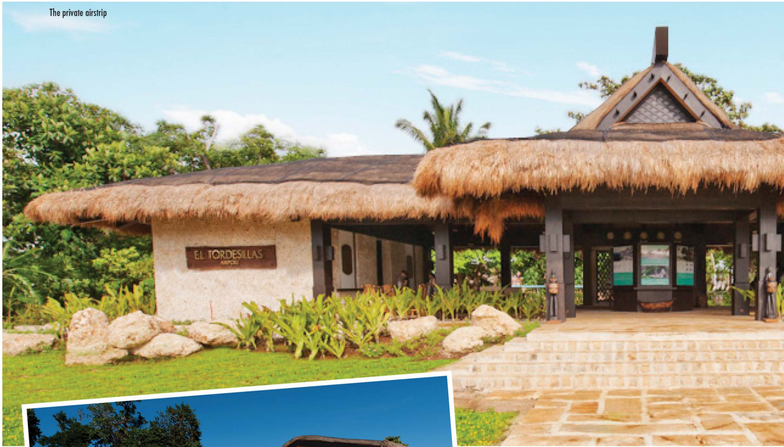
The private airstrip