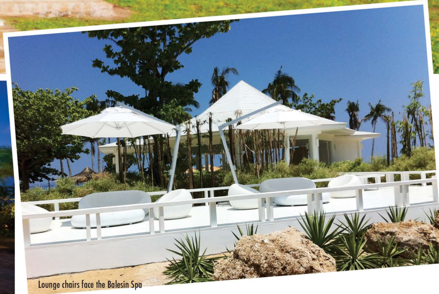
Lounge chairs face the Balesin Spa