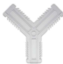
Y 90° POLY