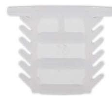
End Piece POLY