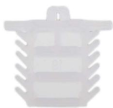
End Plug POLY