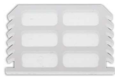
End Piece Duplex