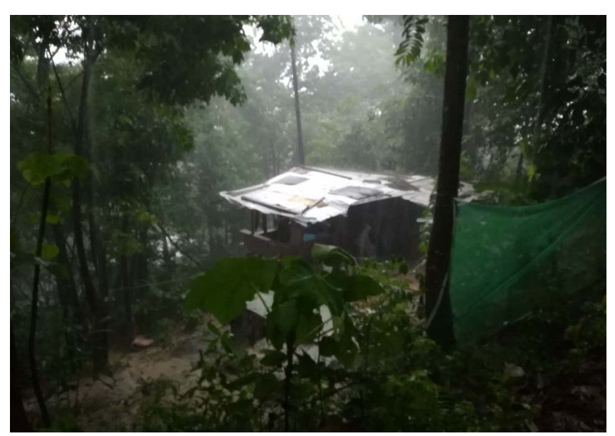
The owner of this house has been here 13 years - he now has a permit