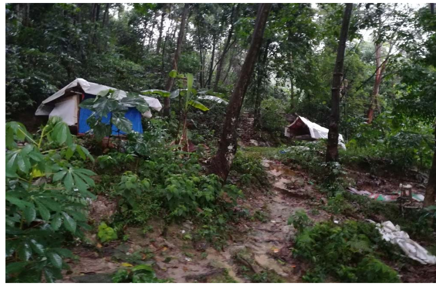
When they think the police might raid the occupants sleep in satellite shelters for a quicker getaway