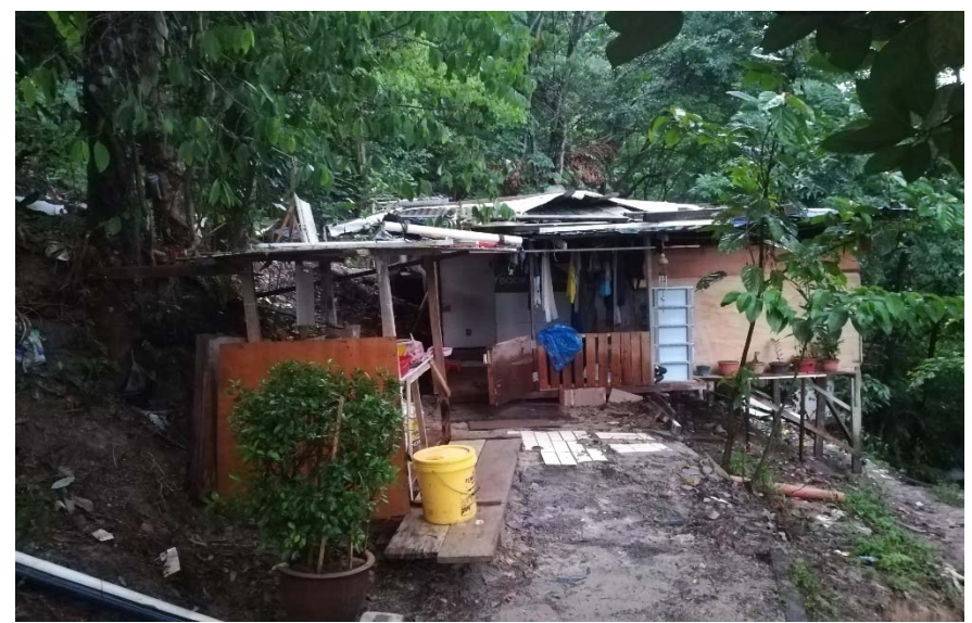
The guy who lives here hasn't been home for 20 years

If you are illegal you cannot go home. I spoke to one couple who have a 12 year old daughter who has never been to school (although she receives some education from one of the churches). The guys making Rm2,600 tended to be legal, but there were many of the usual migrant tales of arriving in Malaysia, permits not being issued and salaries withheld. In the case of one couple, she was legally working as a cleaner and he was an illegal construction worker.