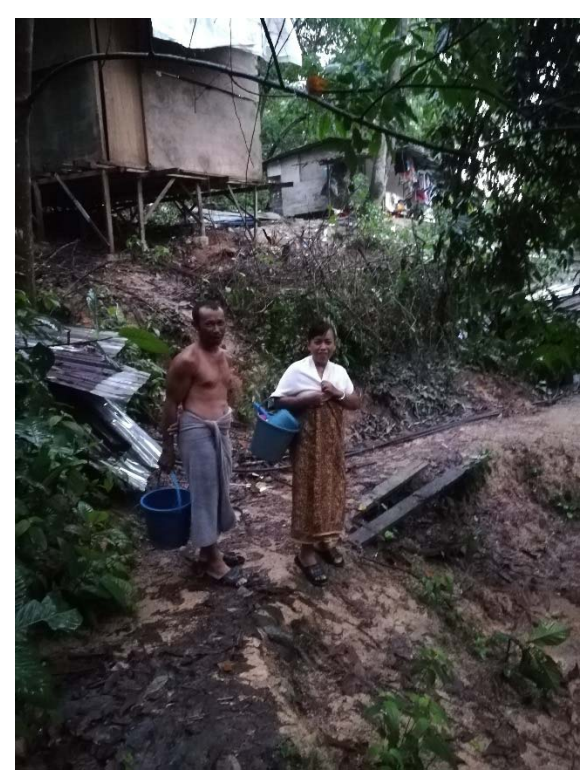
On the way to the communal bath station after work. She's legal and speaks good English. Her husband isn't and speaks Bahasa

Malaysia's new government is gradually getting stricter and enforcement is improving, but these migrants remain hidden in plain sight. They are able to work, save and send money home, unlike in rural Indonesia where there is no money left over.