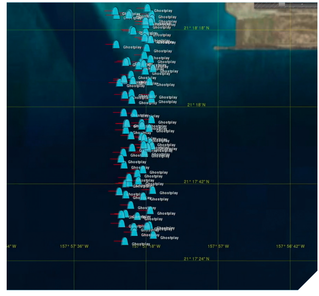
Battlefield simulation with drone swarms and air defense

An effective and coordinated use of defensive strategies by all military forces involved. Not only individual aspects are evaluated, but strategic-tactical action in a network.