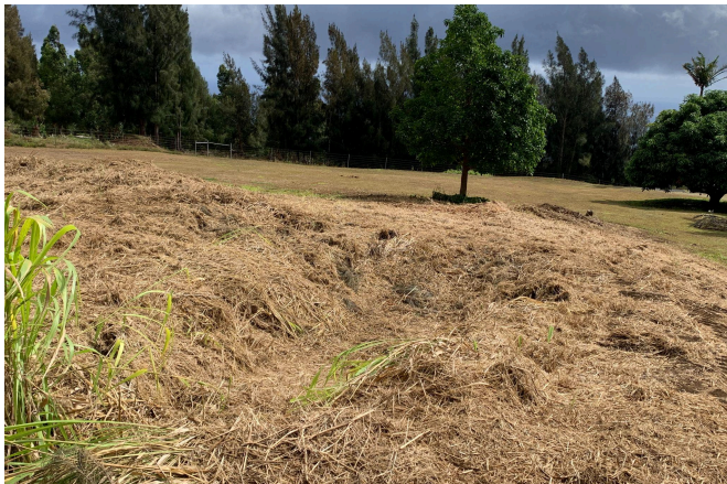
Section of the area that was mulched during phase I

A few years ago, an overgrown section of land was added to our lease as part of an amendment resulting from a leasing error with our neighbor.