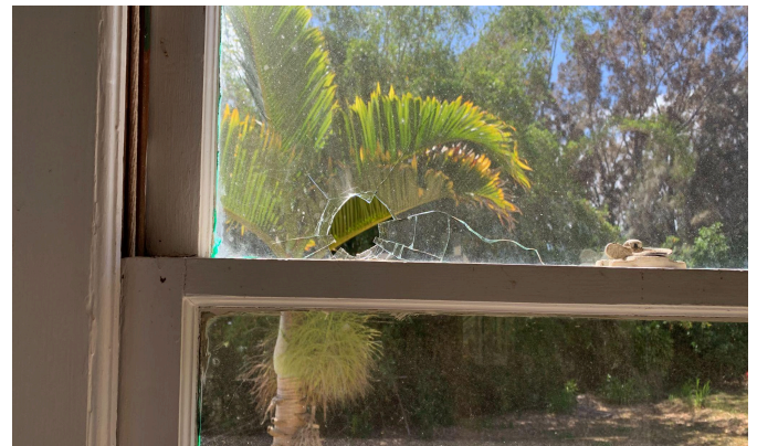
Dining hall window vandalism

Late last month, our security cameras captured footage of a trespasser scoping the property for nearly half an hour. During this time, the individual managed to steal all the toiletries from our outdoor bathroom facilities.