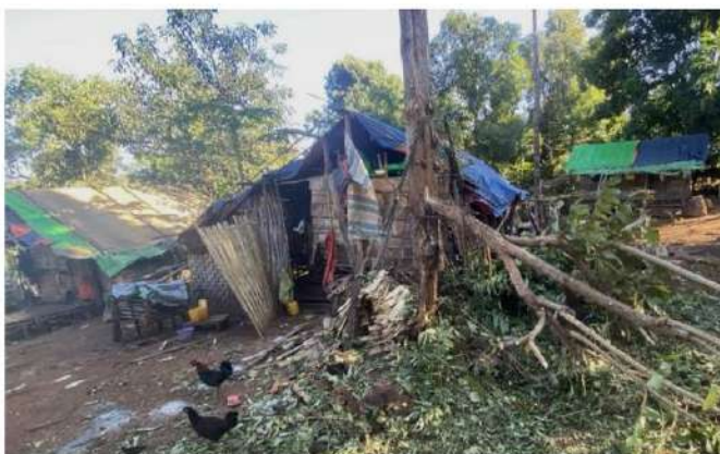
A damaged shelter after an airstrike.

January was a tough month for the Karenni people. There were active clashes in Moby, Phekhon Township, and Loikaw, with the military junta escalating atrocities across the region. Intense attacks on IDP camps have led to widespread displacement, while indiscriminate airstrikes, bombings, and artillery attacks continue to terrorize the civilian population. In January alone, there were at least 10 incidents in which 14 people were injured and 5 civilians were killed. These attacks on civilian areas have caused great instability and fear among residents of the Karenni and Phekhon regions.