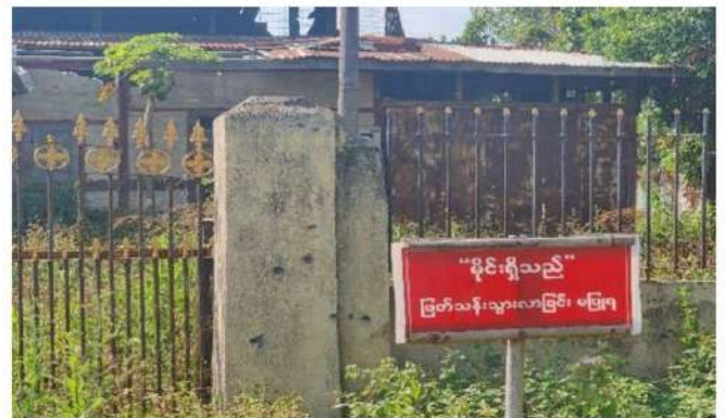
A warning sign alerting of landmines.

As part of its strategy to suppress dissent, the junta has forced thousands of Karenni residing outside the Karenni regions to return to their homes. This move is aimed at strengthening the junta's control over their areas and reorganizing the administrative process.