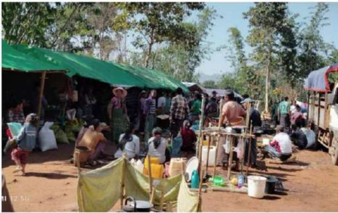
Relocation of new arrivals from Phekhon.

Chaos and instability have forced thousands of displaced people to seek refuge in the remote regions of Karenni. Over time, these areas have become overpopulated, leading to numerous challenges. Security threats remain the primary concern for the people residing in these overcrowded regions. Artillery attacks and airstrikes have devastated some communities causing repeated displacement. Food insecurity, rising commodity prices, severe security risks, disrupted communications, limited humanitarian access, and inadequate health systems have further worsened the well-being of displaced individuals.