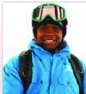
These days I can't wait for the cold period to enjoy winter games.

Currently I am in my final year pursuing a Bachelor of Pharmacy at the School of Pharmaceutical Sciences and Pharmacy, Hokkaido University. I research about rational design of protein-like molecules (foldamers) as medium-molecule drug candidates. I also train to become an all-round clinical pharmacist. My current research has deepened my interest in proteins and nucleic acids and for that reason, I intend to pursue a Ph.D. in biological drug design upon graduation.