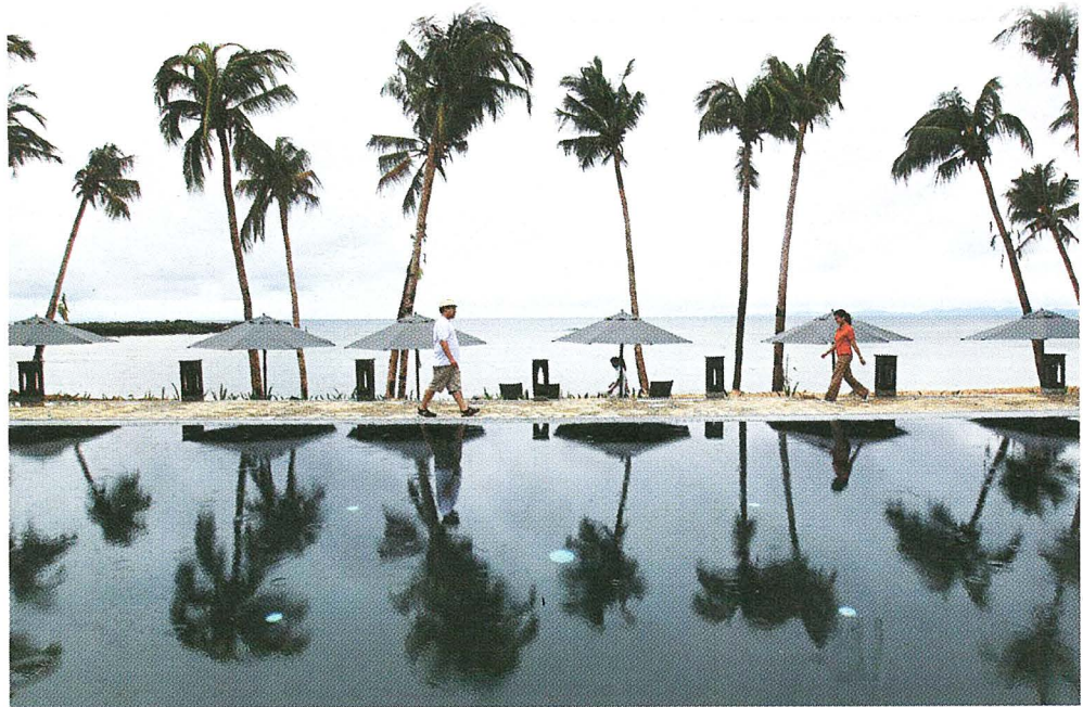
Clockwise from above: the Phuket pool; Bali, which has yet to be completed; the Balesin Island clubhouse; Mykonos' bar/ restaurant; one of the club's planes on the island trip

Would you say the place is "green"? Radically, fanatically green. Plenty of places preach conservation but how many will actually re-position roads in order to avoid knocking down trees? Only 50 hectares of the island's 500 have been developed and a no-fishing zone extends more than a kilometre out from the shoreline. Seas are teeming with marine life. Sewage is recycled on-site using state-of-the-art technology, the water used for irrigation. Drinking water comes from the sky; rain is gathered using a drainage system centred on the 1.5 kilometre-long airstrip and stored in a reservoir. The fruit and vegetables