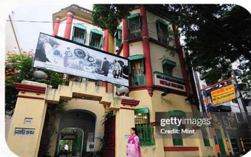
Netaji Bhavan (Netaji Subash Chandra Bose)