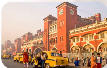
Howrah Railway Station & Underground Metro