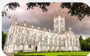
St. Paul's Cathedral