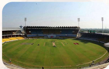
Eden Gardens Cricket Stadium