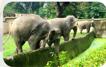
Alipore Zoological Gardens