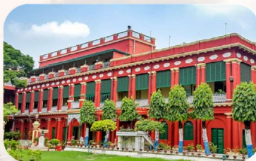
Jorasanko Thakur Bari (Rabindranath Tagore)