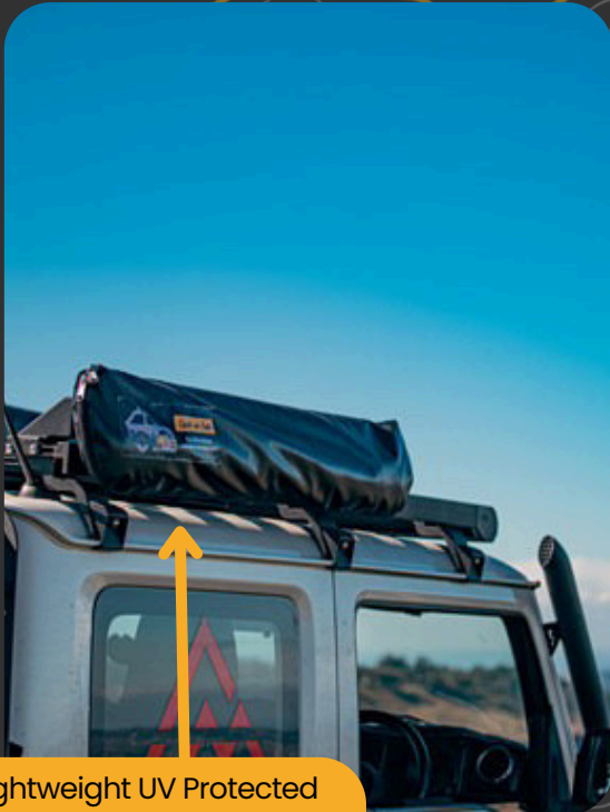
Lightweight UV Protected Black PVC cover bag