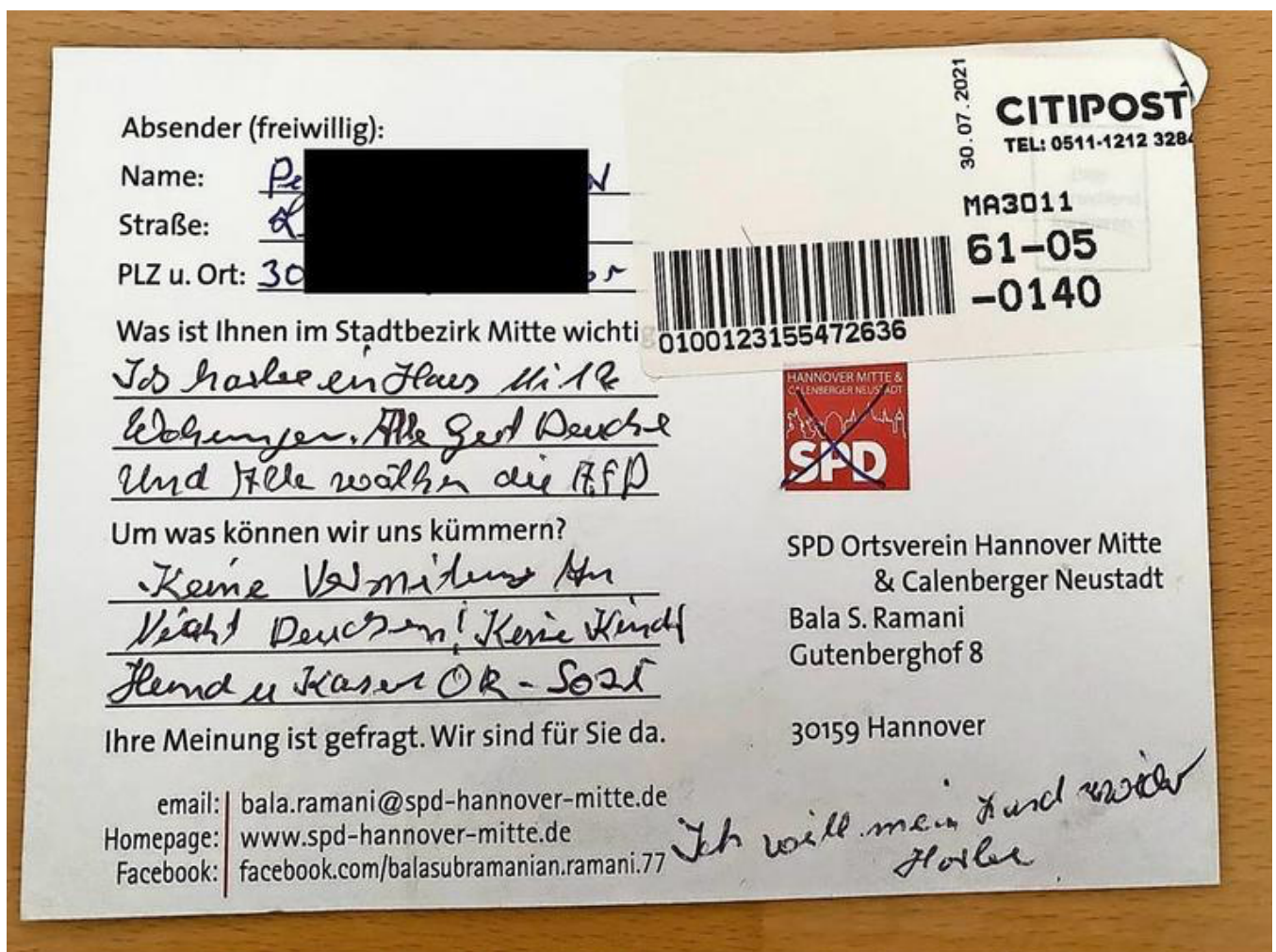
"I want my country back": The text of the right-wing populist postcard.