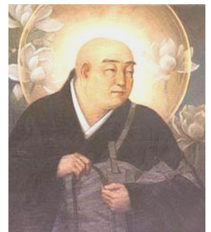
Founder of Jodo Shu : Honen Shonin (1133-1212)

Three hundred years after Honen Shonin passed away, Emperor Gokashiwabaa mandated Jodo Shu to call the anniversary of Honen Shonin's death "Gyoki". Since then, people called his annual memorial service "Gyoki". This occasion