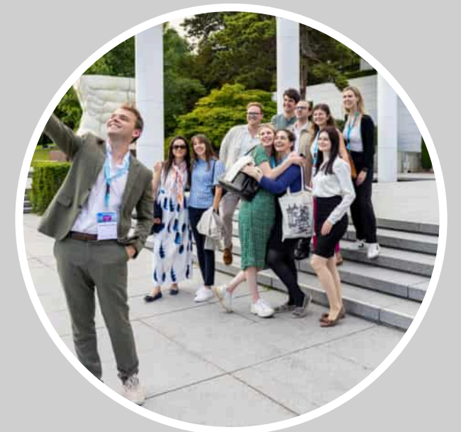
Networking, Meetups and Dinners