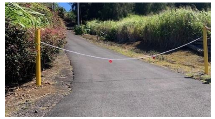
Driveway chain gate

after hours, and motion detector lights were added to deter unwanted visitors. In addition, only limited quantities of bathroom supplies are now left out to deter theft of toiletries.