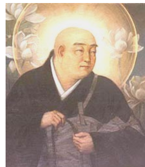
Founder of Jodo Shu : Honen Shonin (1133-1212)

Chutoba is available for this Gyoki service. At this service you may also honor your deceased ancestors with a Chutoba prayer. See above for the Chutoba order form.