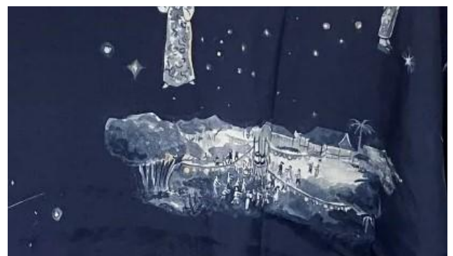
Fabric design featuring HJM

These photos will be proudly displayed in our dining hall, just in time to coincide with our Obon festivities!