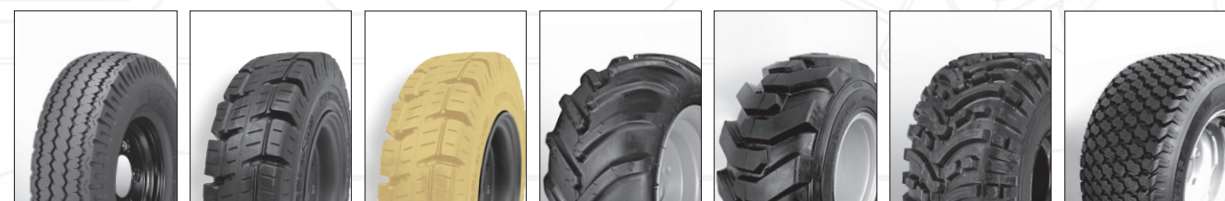
INDUSTRIAL FORKLIFT FORKLIFT NON MARKING TRACTOR SKID ALL TRAC TURF