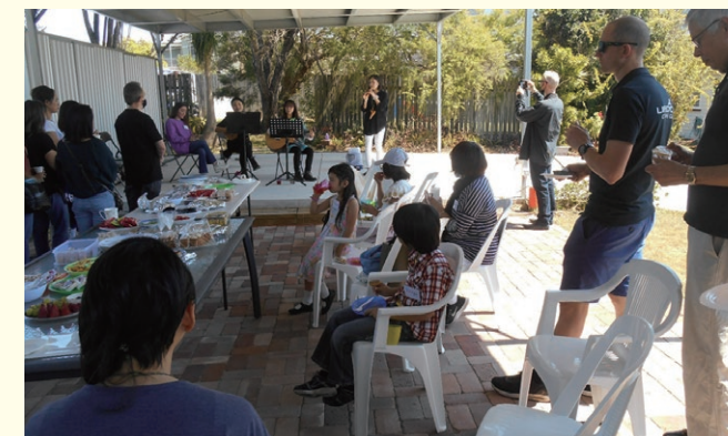
Musical Performance by Members at Obon