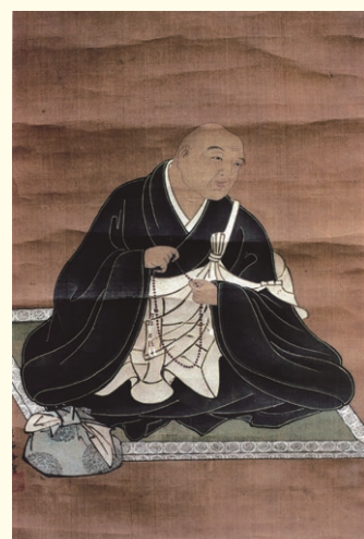
Hōnen Shōnin (1133-1212)