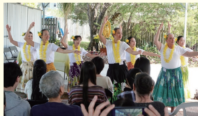
Hawaiian Hula Dance Club members performing at Obon

increased significantly. Added to this is the sharp increase in bank interest rates. Some people can barely repay their mortgage while others face exorbitant rent hikes. Further adding to household bud-