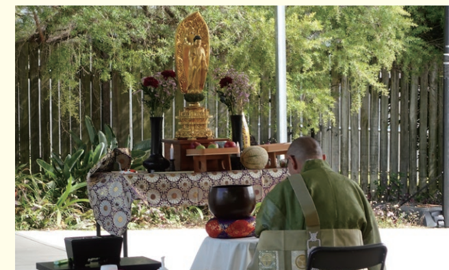
The Light of Amida Shines on Everyone