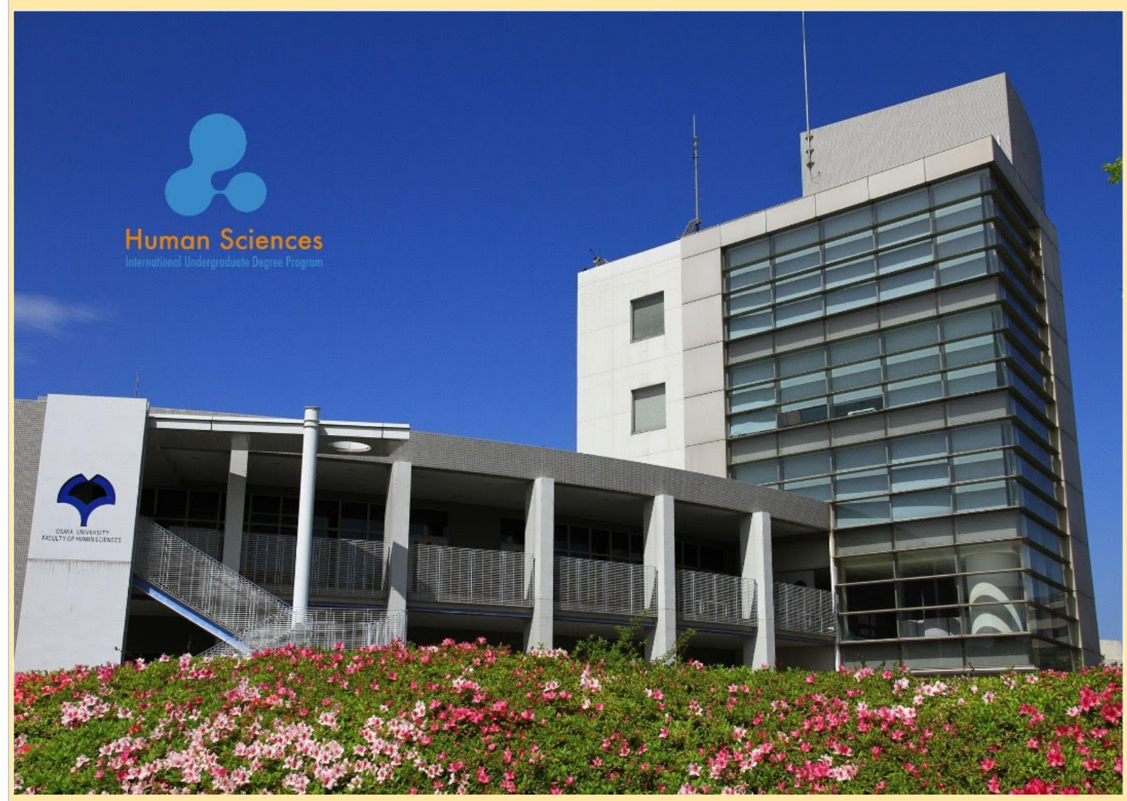
[Bachelor Course Intro.] OSAKA UNIVERSITY, Human Sciences International Undergraduate Degree Program

1) Degree title you pursue: Bachelor of Human Sciences