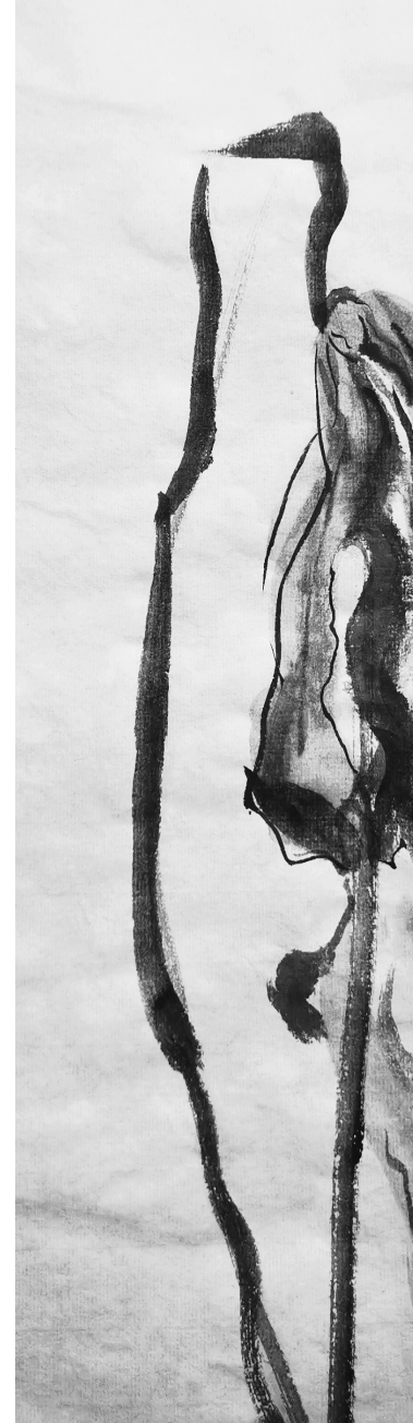
reflecting, refracting, 2024 Rice Paper, Water Ink, 78cm x 48cm