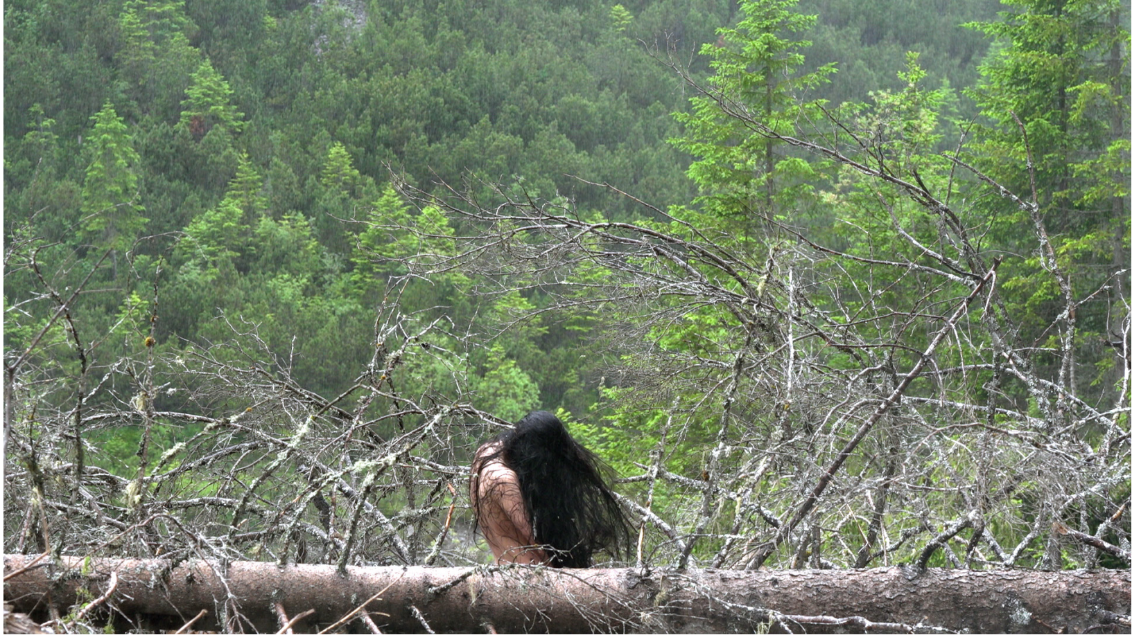
Mother Forest Part II, 2024