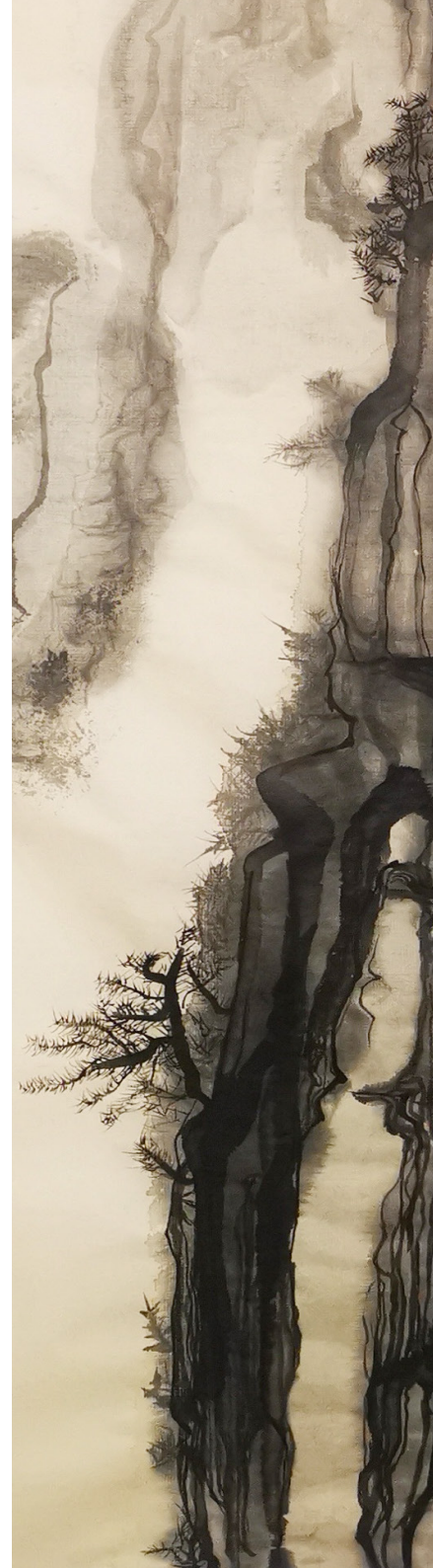
mountain mist, 2025 Rice Paper, Water Ink, 78cm x 48cm