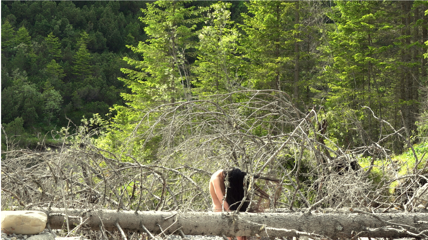
Mother Forest Part I, 2024