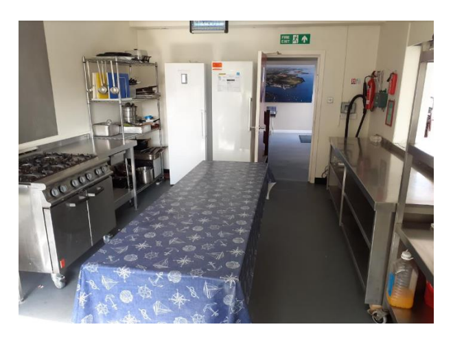
Kitchen East Down Yacht Club