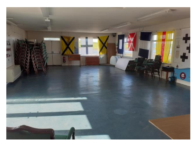
Downstairs Function Room. EDYC