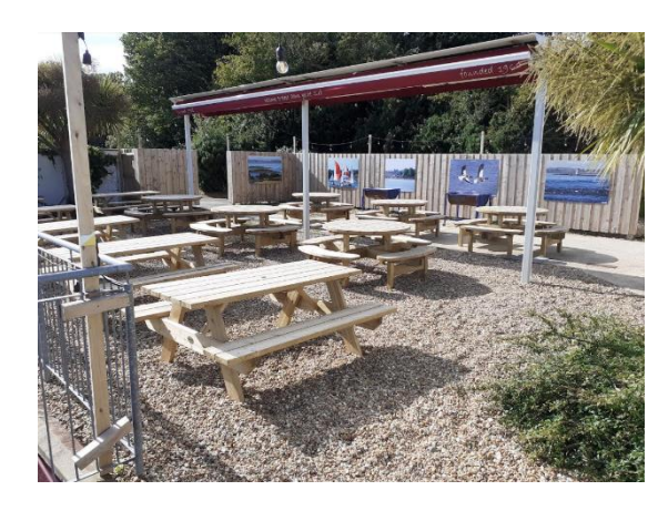
Outside Picnic Area EDYC