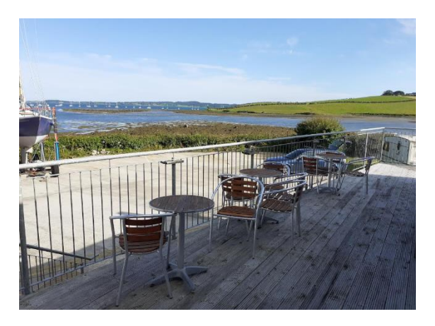
View down the Dorne from the front of the club