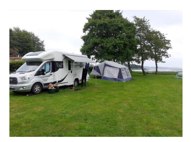
Main Tent Area looking East.

This was the scene during the UK Open Canoe Sailing Association visit June 2022.