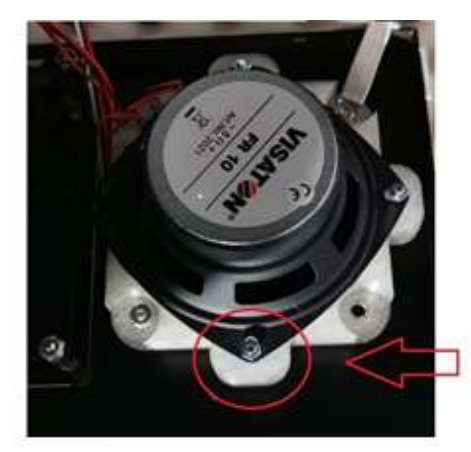
Attach capacitor here