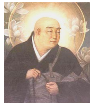
Founder of Jodo Shu : Honen Shonin (1133-1212)

Shonin's death “Gyoki” Since then, people called his annual memorial service “Gyoki”. This occasion implied that Honen Shonin was clearly accepted and revered by the Emperor and the people.