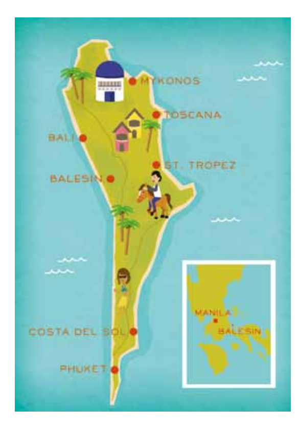
Illustration by Ruth Rivera

INDULGENCE: With 7.3 kilometers of powdery whitesand beaches, Balesin invites you to play. Scuba diving, snorkeling, wake boarding, and kitesurfing are all available. So are long walks on the beach.