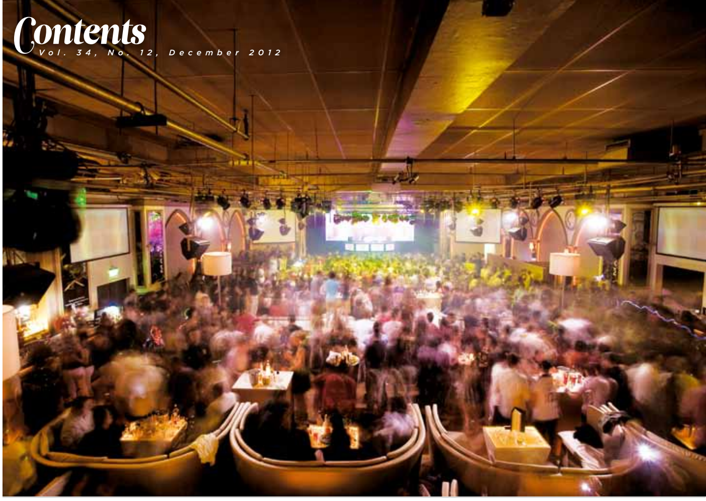
IT'S PARTY TIME AT REPUBLIQ AT RESORTS WORLD MANILA.