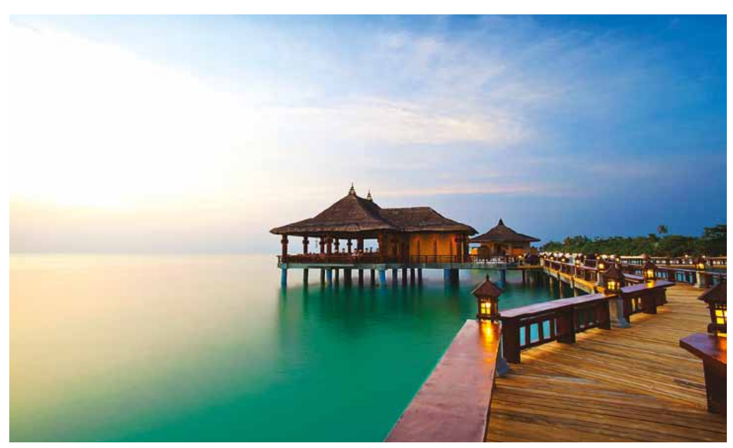
ONE ISLAND, SEVEN DESTINATIONS: Dinner in Italy then breakfast in Phuket? You bet. Seven hospitality villages at the Balesin Island Club offer amenities ranging from rooftop whirlpools in Mykonos Village to garden cabanas in Phuket Village. Here, stilt villas at the Bali Village above the tranquil Lamon Bay.