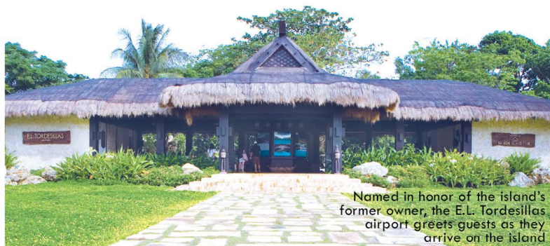
Named in honor of the island's former owner, the E.L. Tordesillas airport greets guests as they arrive on the island

Through mere steps away from the surf, family-friendly pools give guests an alternative option for water activities