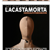
La casta morta , 2016