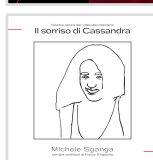
Il sorriso di Cassandra , 2023