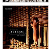
Anamoni , 2017