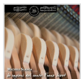
Le ragioni del canto , 2014