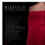
Magnificat , 2022