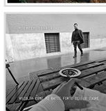
Ascolta come mi batte forte il tuo cuore , 2023