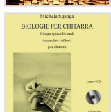
Biologie per chitarra , 2018