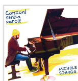
Canzoni senza parole , 2020