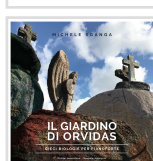
Il giardino di Orvidas , 2023