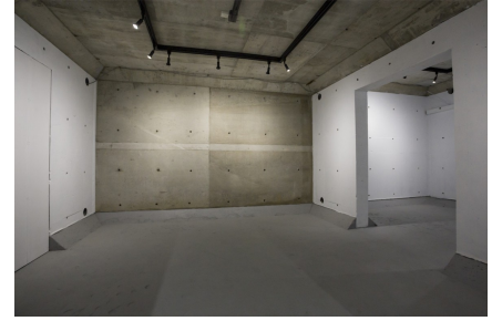
Studio 1 Studio 2 Gallery space