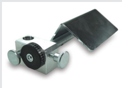
Item No. 17358 Workpiece support with angle adjustment